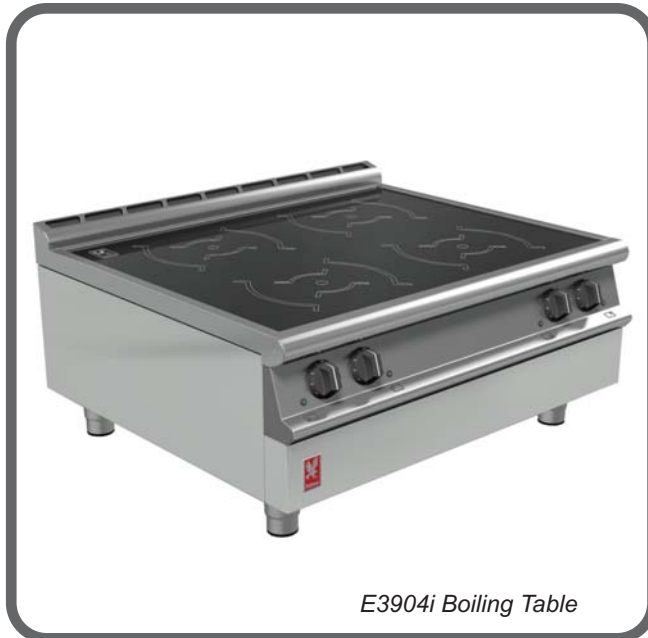
E3904i Boiling Table